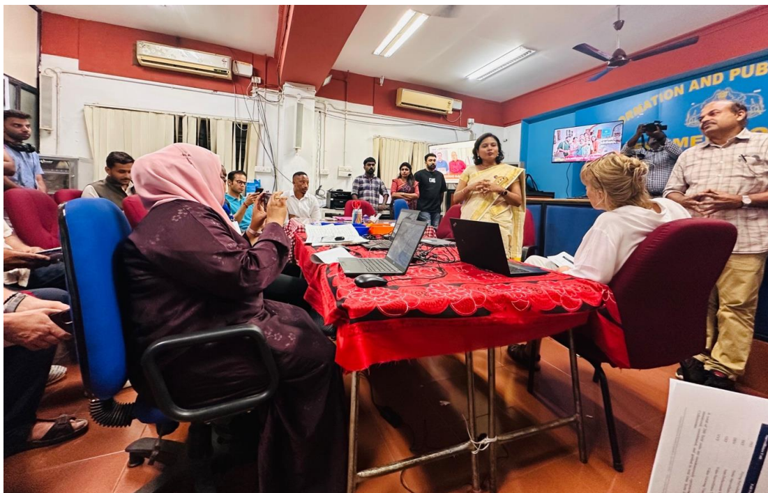
The Kerala election Control Room — monitoring thousands of polling stations in real time

Briefed by the State Chief Electoral Officer on Kerala’s electoral approach. Visited Dispatch Centres and the central Control Room monitoring CCTV feeds from thousands of polling stations. Boat cruise to observe polling stations established on Kerala’s islands. Dinner with the Police Commissioner and senior electoral officials.