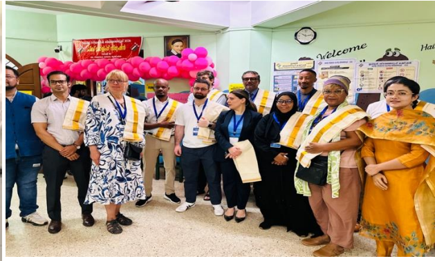
Delegation welcomed at a Pink Booth, Kerala