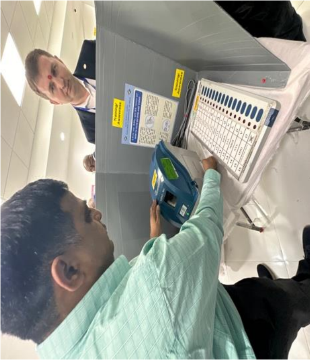
EVM demonstration at IIIDEM