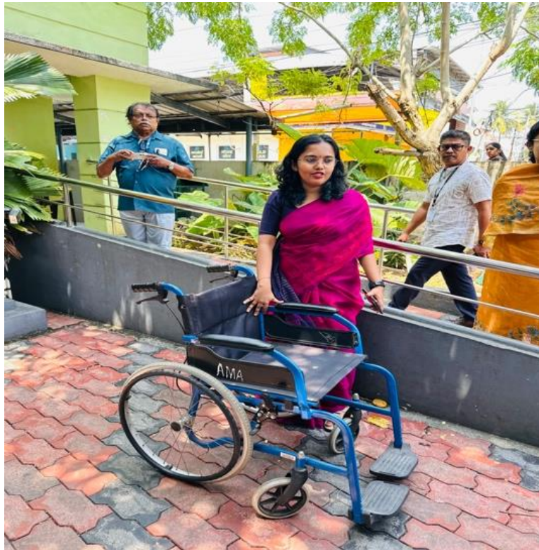
Accessible ramp and wheelchair facilities at a Kerala polling station

The delegation found the experience deeply instructive. Witnessing elections at this scale — in one of the world’s most populous and diverse democracies — offered a rare opportunity to see how robust systems, significant resources, and a culture of continuous improvement can combine to strengthen public confidence in the democratic process. The commitment to ongoing reform, rather than complacency with existing achievements, was a particularly striking aspect of India’s electoral culture.