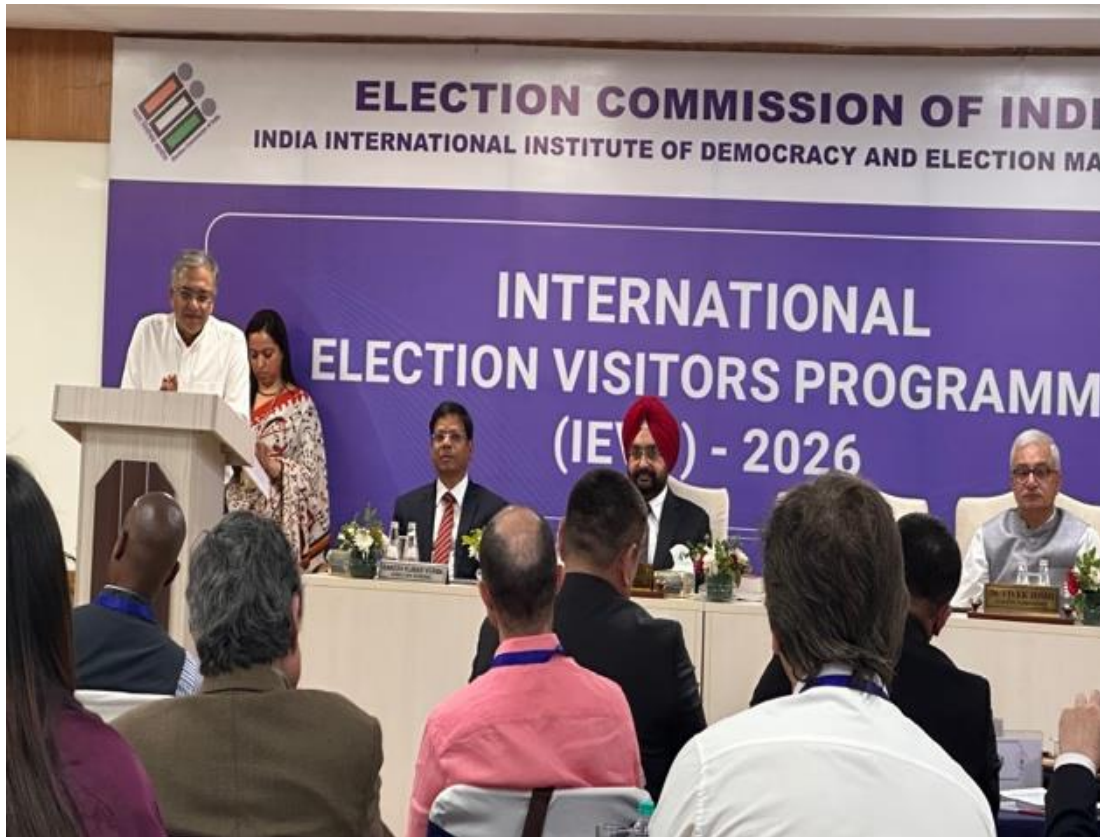
Opening plenary of the IEVP 2026 at IIIDEM, New Delhi